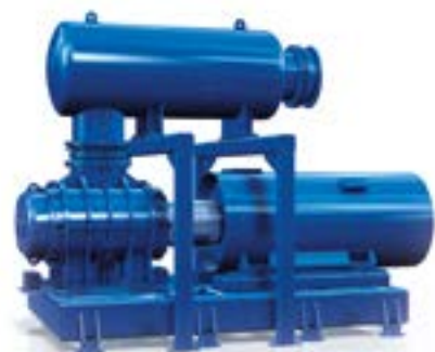
Alpha Blower package

2-/3-lobe blower package with direct or belt drive in modular system. 104 model variants. Low pulsation and reduced piping noise. Oil system fully integrated in the stage. Integrated sound reduction measures.