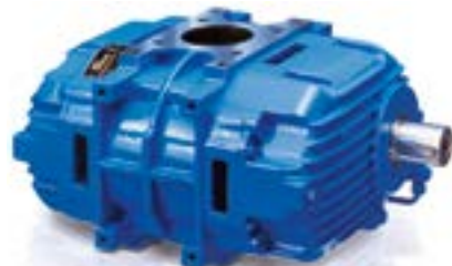
Bulk goods vehicle GM 13.5..13.f7-1 pos. pressure blower stage

Robust 2- and 3-lobe blower stage for installation in tankers and silo trucks with extended pressure differentials of up to 1.2 bar. Conveyance in two directions possible using either horizontal or vertical flow. Proven technology, oil-free.