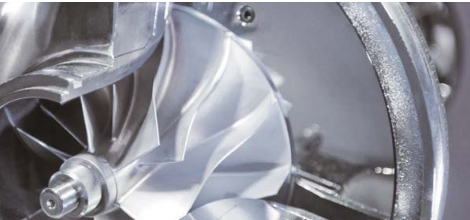
The AERZEN turbo impeller. Individually designed for every performance class – peerless efficiency.

AERZEN turbo blowers. Over the years we have perfected the technical excellence of our assemblies, acquiring an expertise that has set the global standard in the process. This is reflected in improved energy efficiency, low life cycle costs and specially developed core components. It is an expertise present in every detail of AERZEN's continuous flow machines.