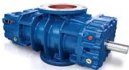
Blower stage GM 35 ... 1080 L

Sturdy 3-lobe blower stage for plant engineering. Suitable for a wide range of applications. Designed to be belt-driven. Low pulsation levels and reduced piping noise. 22 standard sizes.