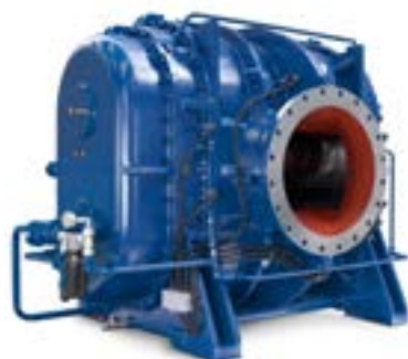
Alpha Blower stage

104 model variants with low pulsation, reduced piping noise, integrated sound reduction measures and oil system fully integrated in the stage. 2-/3-lobe blower package with direct or belt drive in modular system.