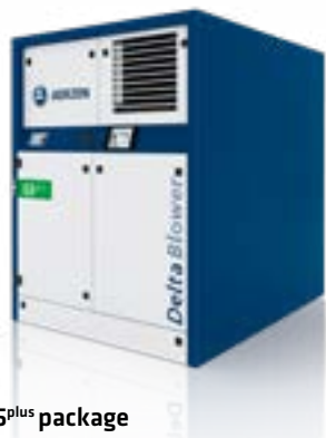
Delta Blower G5 plus package

Energy efficient, compact assembly. Delta Blower G5 includes optimised intake filter silencer and base support for reduced pressure loss. Resource saving cooling concept. Available in 2 sizes.