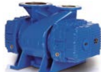
GMa/b/c ... m negative pressure stage with pre-inlet cooling

Proven 3-lobe blower technology for plant engineering for forced conveyance at negative pressure up to 80% vacuum. Oil-free and extremely sturdy. Belt or direct drive version. Ideal for bulk and silo vehicles.