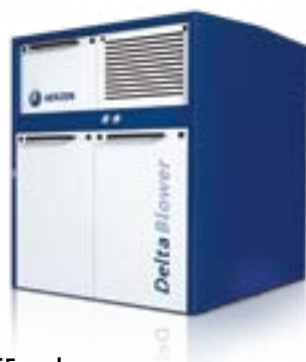
Delta Blower G5 package

Positive displacement blowers find their key area of application in the pneumatic transport of bulk goods and waste water treatment. AERZEN offers right-sized solutions in this sector, delivering high-performance blowers in our standard, compact and special classes, right-sized to the most diverse applications and individual customer requirements. Always the best choice. As powerful as they are economical.