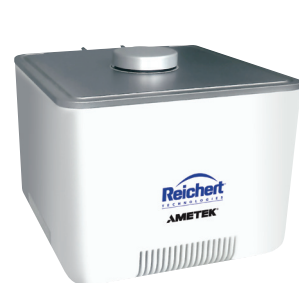
Refractometer AR9 Exceptional accuracy to 5 decimal places

Continuing its record of leadership in refractometry, Reichert introduces two new refractometers to the Advantage Reichert AR Series adding to its line of sophisticated benchtop analytical instruments. These new instruments, the AR9 and the AR5 are reliable, durable, accurate and tough enough for the most demanding applications. The AR9 is precise, having the capability to provide measurements for the most critically regulated industries. Both the AR9 and AR5 offer Peltier temperature control at an attractive price, while providing the connectivity and flexibility inherent in all of Reichert's new products.