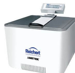
Refractometer AR5 Exceptional accuracy to 4 decimal places