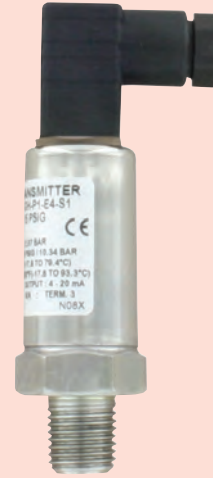
General Purpose Housing (-GH) with DIN C