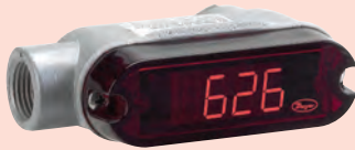
626 with LED Display (CH housing only)