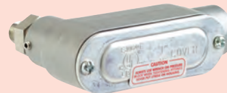
Conduit Housing (-CH)

*Please see our website for dimensional drawings.