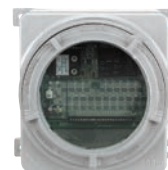
DCT in optional Explosion-proof Enclosure.