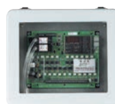
DCT in optional NEMA 4/4X weatherproof enclosure.