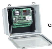
Master Board Stacked with Channel Expander.