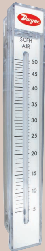
Model RMC 10" scale, 15-3/8" high

Polycarbonate, Gas Flow from 0.05-1800 SCFH, Water Flows to 10 GPM