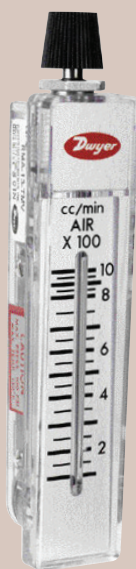
Model RMA-TMV 2" scale, 4-13/16" high