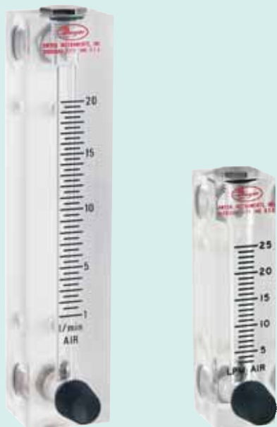
Model VFA and VFB