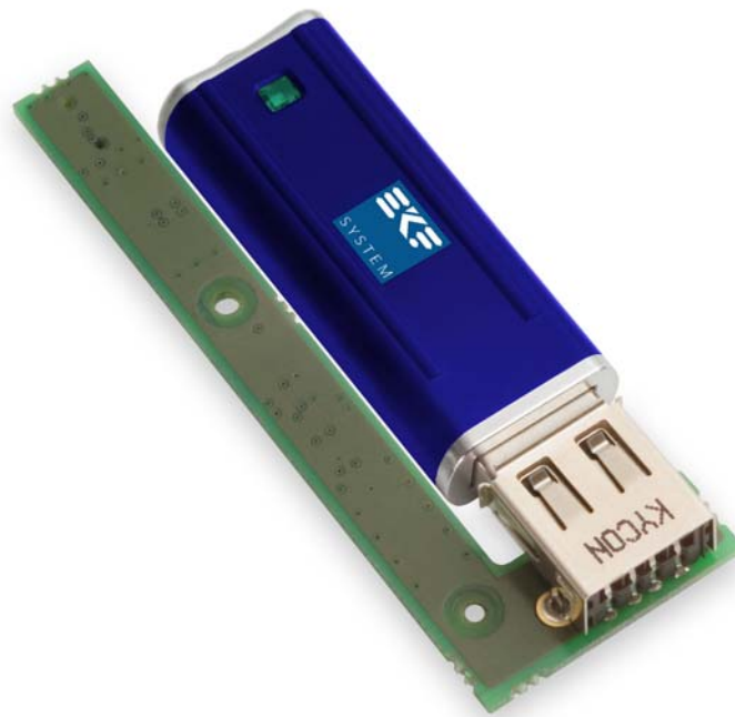
C15-DON (Shown with USB Stick)