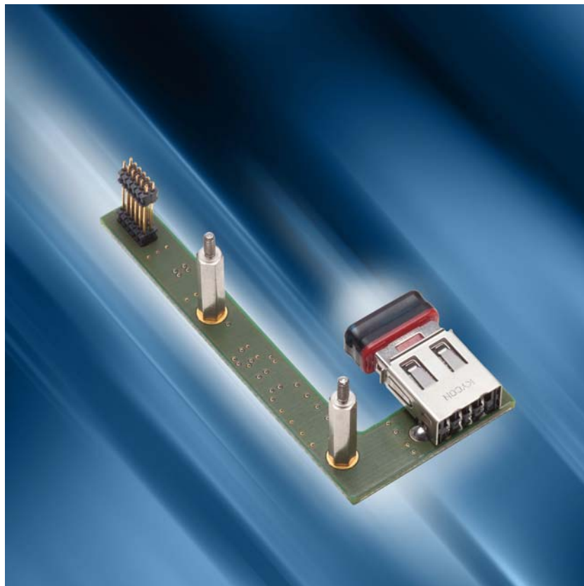
C33-DON (Shown with USB Stick)