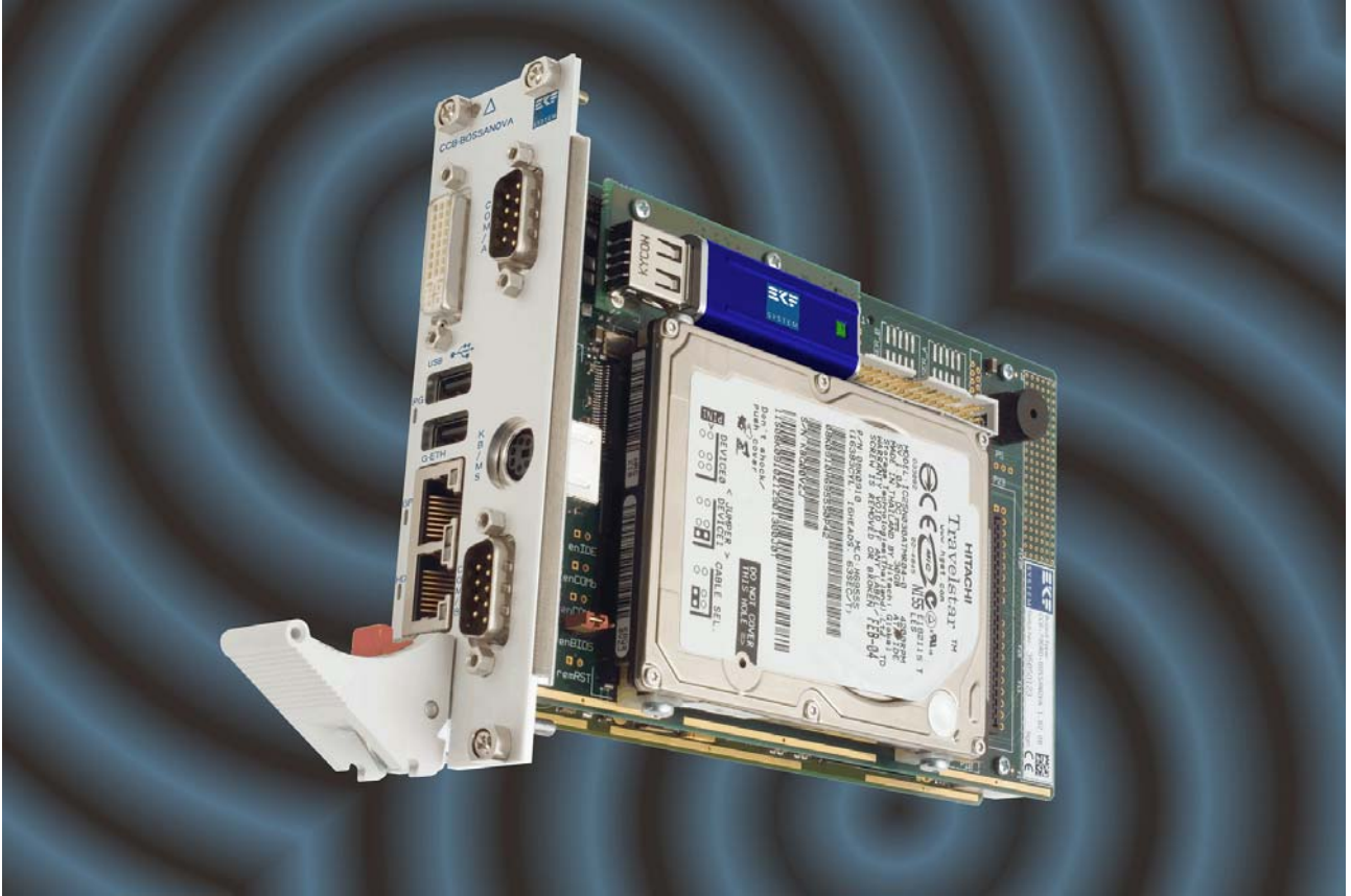
CPU Card & Side Board Assembly with C15-DON (Above the Disk Drive)