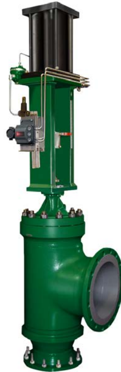
Fisher FBT Valve with 585C Long Stroke Actuator