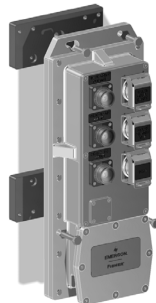
Figure 1. LCP200 with Mounting Bracket

Refer to figure 2 for dimensional information. The LCP200 local control panel has four mounting holes for on-site mounting of the device. The LCP200 must be installed so that the wiring connections are on the bottom to prevent accumulation of moisture inside the box.