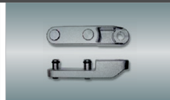
Universal Wheel Clamp Extension Kit