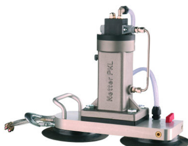
VAC 15 with PKL 740 ST