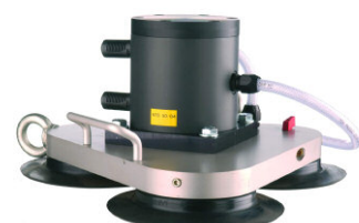
VAC 30 with NTS 50/04