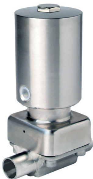
DN 15 - 50 Cf. 4