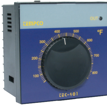
Low Cost Non-Indicating Control!