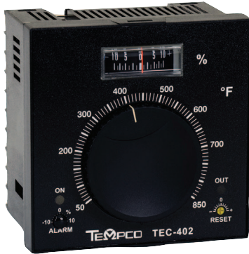
With Process Temperature Deviation Meter!