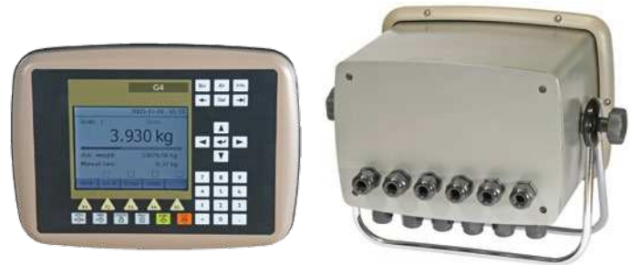
Panel Mount (PM)