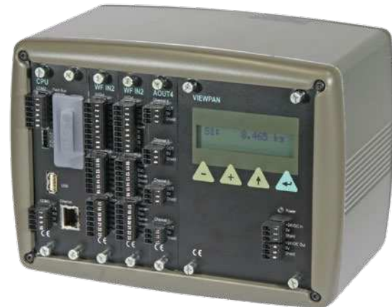
DIN-Rail Mount Unit

G4-RM instruments accommodate up to three different, easily installed, modules for advanced performance, more functional channels, custom applications, or repair. This provides customers with a highly flexible, upgradeable, single instrument system capable of weighing up to six independent vessels or scales. For web tension applications, up to six zones (rolls) can be monitored simultaneously. Inputs and outputs can be configured according to customer requirements.